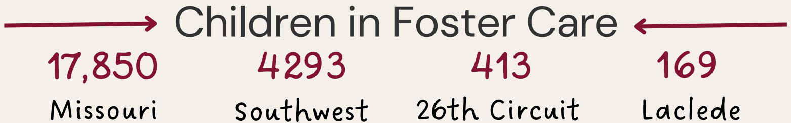
Data from the 2024 Children's Division Annual Report

In 2025, as numerous children entered foster care during moments of deep crisis, Live 2 Give Hope stepped in to meet them in their hour of need. When families faced sudden disruption and uncertainty, our community—through the generosity of donors and the dedication of volunteers—made it possible to respond with compassion & care . Even after losing significant funding halfway through the year, no services were stopped or slowed; instead, Live 2 Give Hope pressed forward with even greater passion & tenacity . Serving families in Laclede County, across the 26th Judicial Circuit, and beyond, we remained committed to supporting those in need and refusing to turn families away. Through immediate support & lasting networks of care , crisis was met with hope —ensuring children and families were not alone and were supported toward a more stable future .