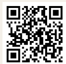
Mobilizing Community Solutions