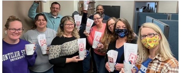
In February we distributed over 200 Valentine's gifts to local foster children, foster parents & social workers.

We are proud to announce our latest offering: The Prom Closet with over 600 prom dresses! After 16 years, Heritage Baptist Church made the difficult decision to close their Prom Closet to make room for their expanding congregation. They have generously donated all of their dresses, shoes & other accessories to Live 2 Give Hope to continue their legacy of making prom magical without spending a fortune. We appreciate their generosity!