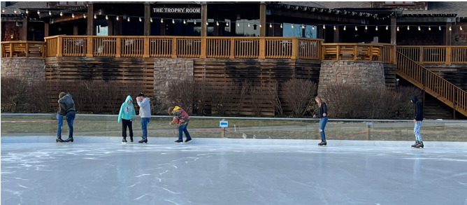
In January we hosted a Family Ice Skating event for dozens of foster children.

We have been blessed to have generous donors, faithful volunteers & the ability to expand our services to dozens of local families so far in 2022. The 2nd annual Branson H-E-A-R-T Victim to Victim Retreat in March hosted three courageous women on their path to healing from sexual assault.